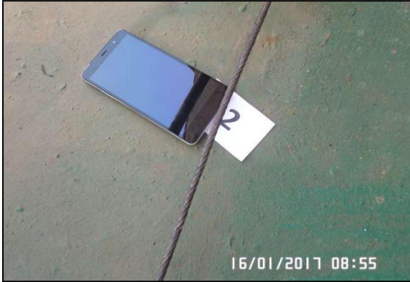
Figure 3: Mobile phone on the accident site

He hastened to the boat deck and noticed that the person was wearing shorts, a jacket and a pair of black jogging shoes, and lying motionless on his back near the ship's ladder. A mobile phone set (Figure 3) was close-by.