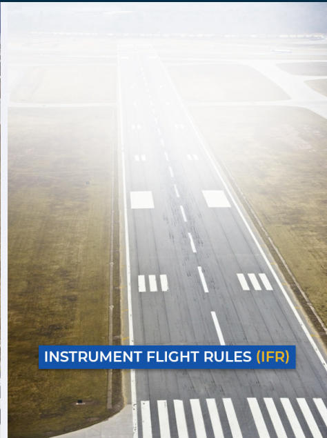
INSTRUMENT FLIGHT RULES (IFR)