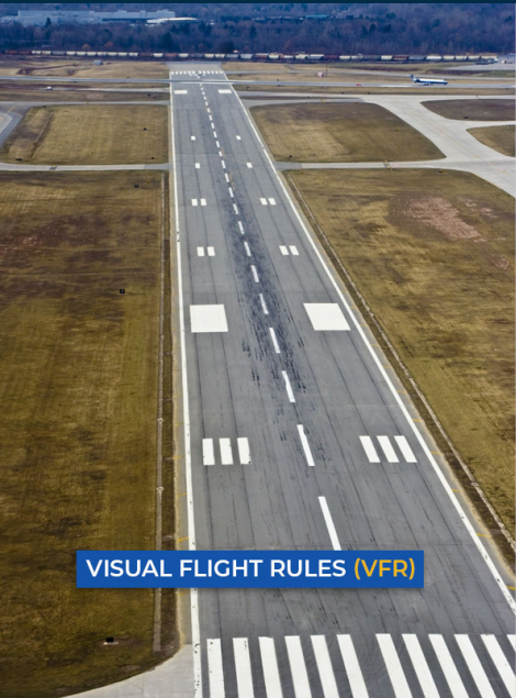
VISUAL FLIGHT RULES (VFR)